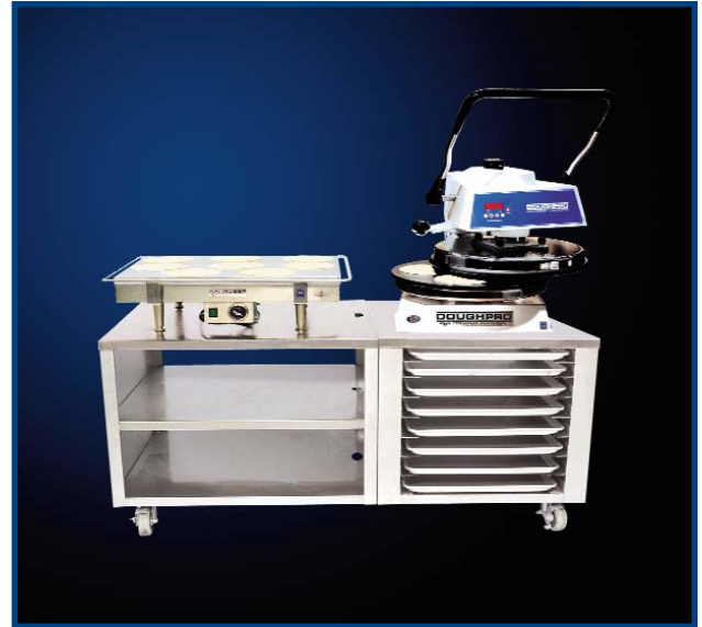
Shown with TW2025, DP2000 & Sheet Pans. (not included)

Step 3: Place the flattened tortillas on either our model TW2025 or TW1520 grill. The tortillas will finish in a matter of minutes and then they can be served hot FRESH off the grill.